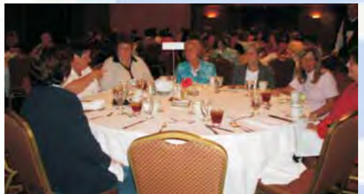
Above pictures taken at the MHIMA President's reception.