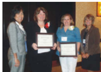
EDUCATORS AND SCHOLARSHIP WINNERS FROM SCHOOLCRAFT

Michigan Medical Record Charities was able to award seven $750 scholarships this year.