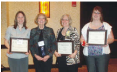
EDUCATORS AND SCHOLARSHIP WINNERS FROM FERRIS STATE UNIVERSITY