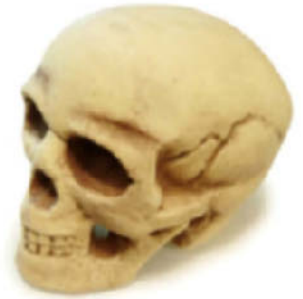
DOWN RIVER DIRTY