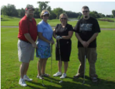
DAVENPORT UNIVERSITY TEAM 1