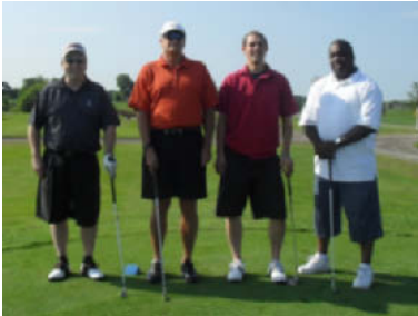
IRON MOUNTAIN TEAM