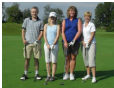
LAST PLACE TEAM SOURCECORP