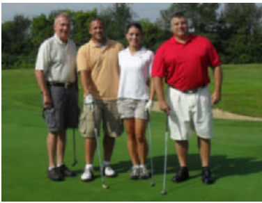
FIRST PLACE TEAM QUADRAMED CORPORATION