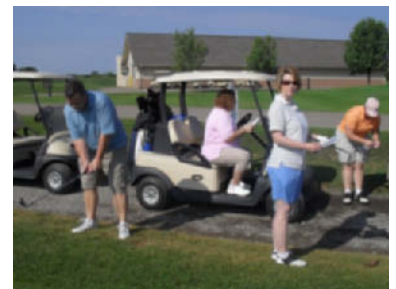
CHARLIE'S TEAM IS WARMING UP