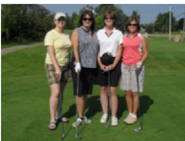
TLM CONSULTING TEAM