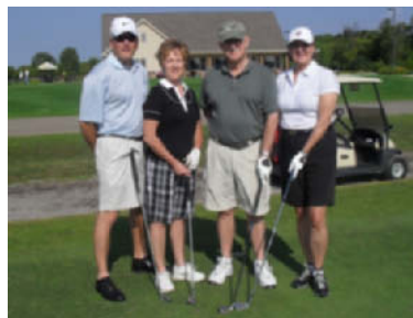
THE WALKER FAMILY TEAM