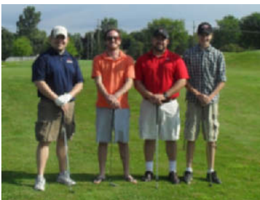
DAVENPORT UNIVERSITY TEAM 2