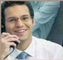
Business Telephone Systems

Can we provide you with the right solution?