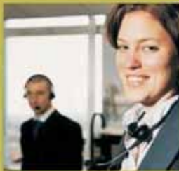
Dictation Hardware and Software